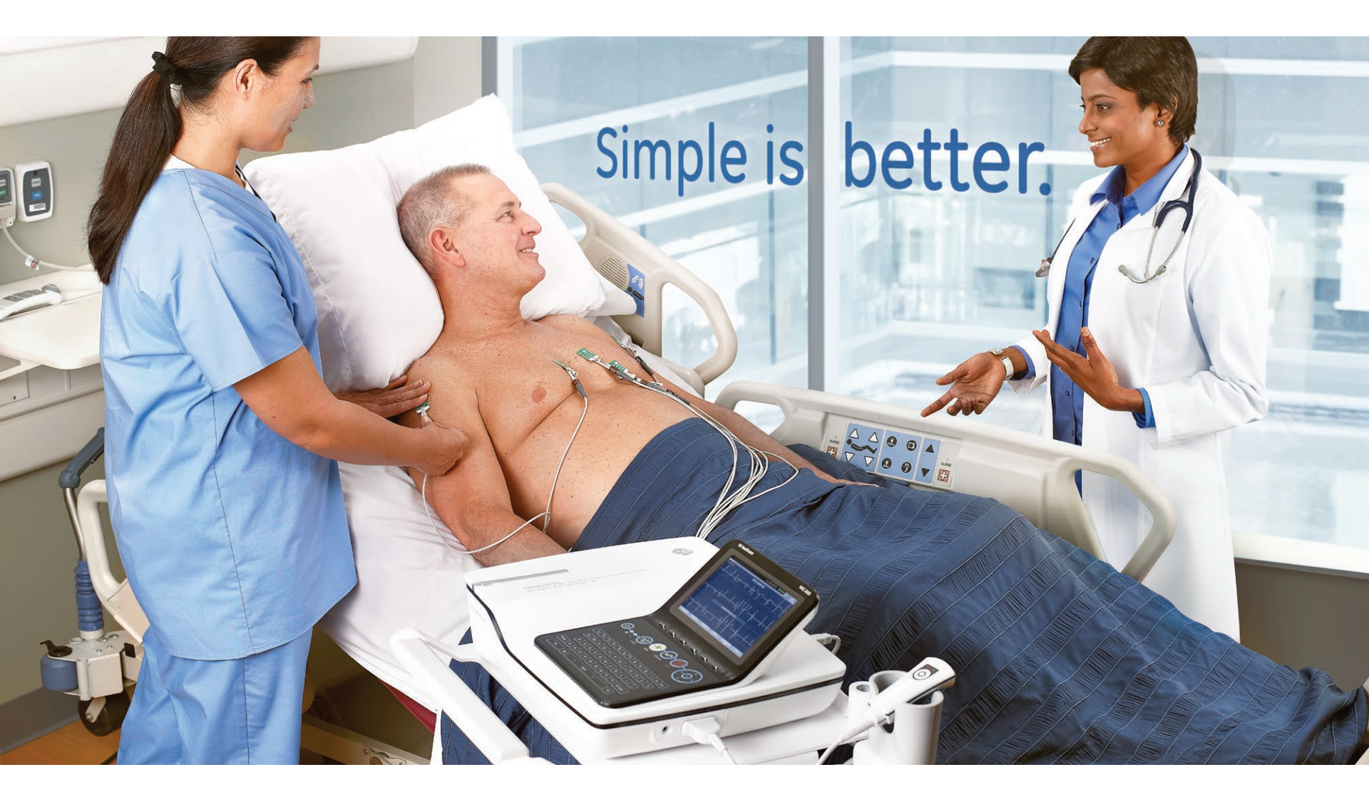
MAC 2000 ECG Analysis System Streamlined for your hospital