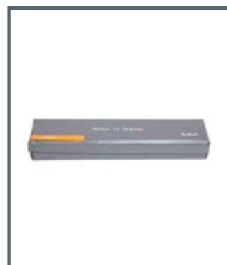
Packed in a robust bag