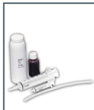
Accessories for Ambu IV Trainer