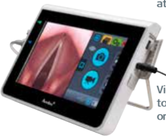
Video-out functionality allows you to display the live image of aView™ on an external monitor, e.g. for training.