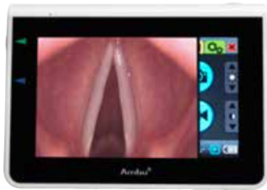
Image Extend enlarges the live image on aView™ for better viewing at a distance.